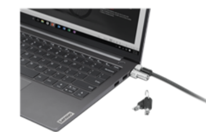
NanoSaver Cable Lock from Lenovo