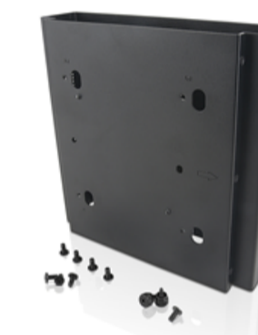
ThinkCentre Tiny Sandwich Kit II