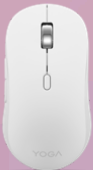
Lenovo Yoga Bluetooth Silent Mouse (Seashell) GY51S61925

Please click here to view the full list of accessories.