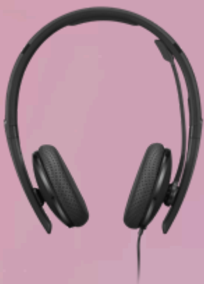
Lenovo Wired VoIP Headset (Teams) 4XD1M45626