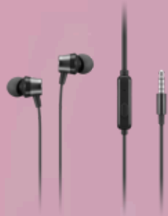
Lenovo Analog In-Ear Headphones Gen II Bulk Package (20pcs) 4XD1T54899