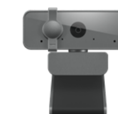
Lenovo Select FHD Webcam Gen2