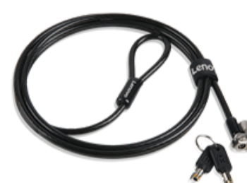
Kensington MicroSaver DS 2.0 Cable Lock from Lenovo