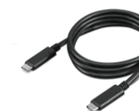
Lenovo USB-C Cable 1m